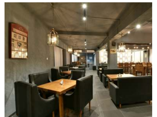
Restaurant & Lounge